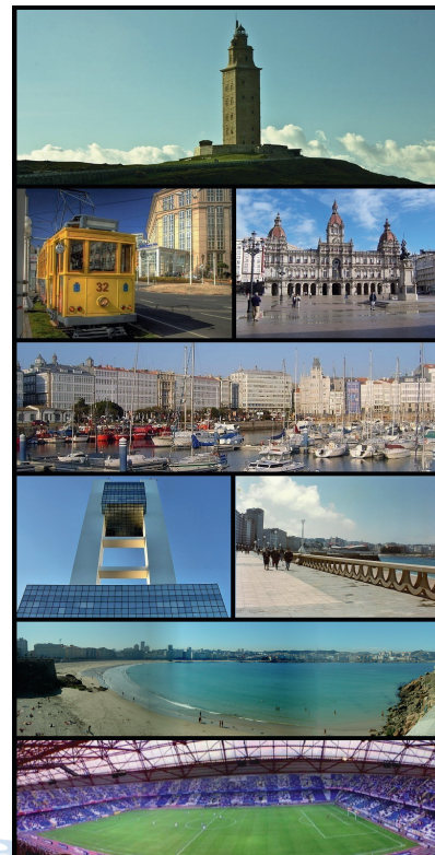
Coruña collage made with commons' photos

The University of A Coruña is a public institution whose primary objective is the generation, management and dissemination of culture and scientific, technological and professional knowledge through the development of research and teaching. Part of its mission is the formation of an open, critical, democracy and solidarity citizenship, capable of analyzing reality, diagnose problems, formulate and implement solutions based in knowledge and oriented to the common good.